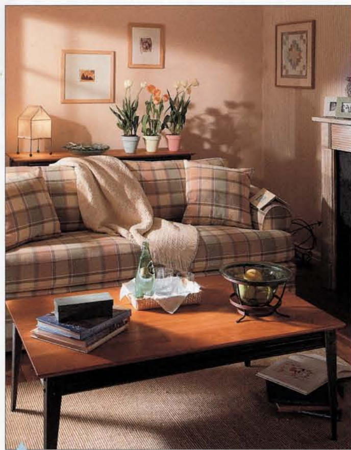
DRAWN TO COMFORT

Keep decorating expenses to a minimum by dressing up the sofa for maximum effect.