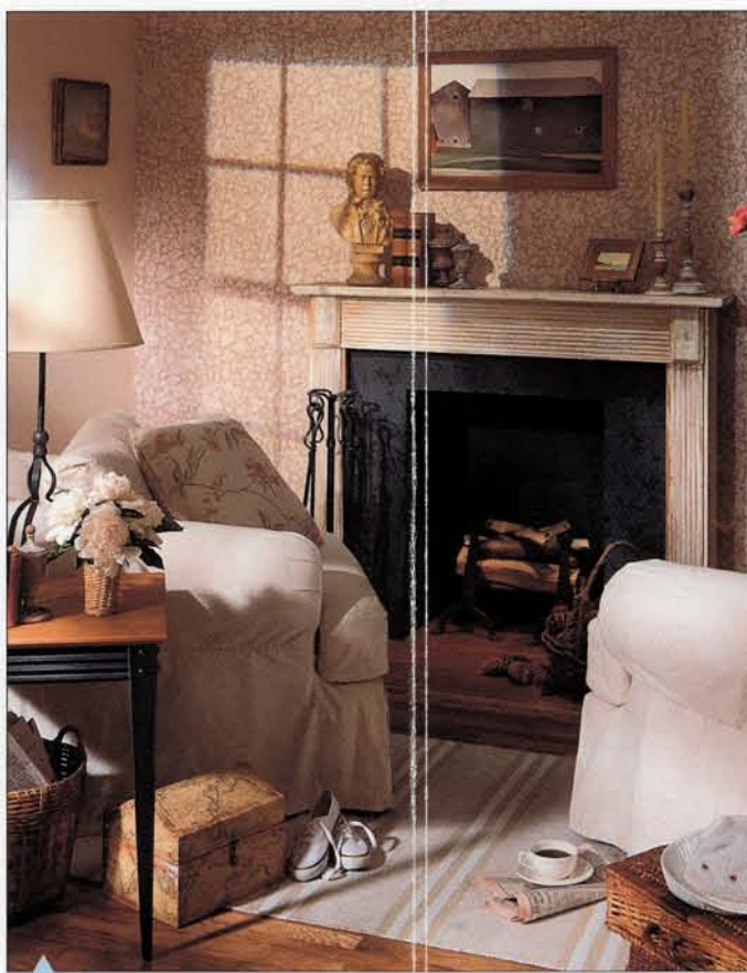
COZY BY THE FIRE

Gravitate to a fireplace all year round by making a few design changes in the room.