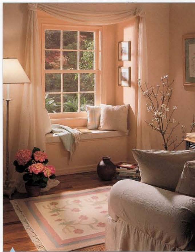
INVITATION TO A VIEW

When the view is glorious and the incoming light creates a cozy feeling, make the window the center of attention.