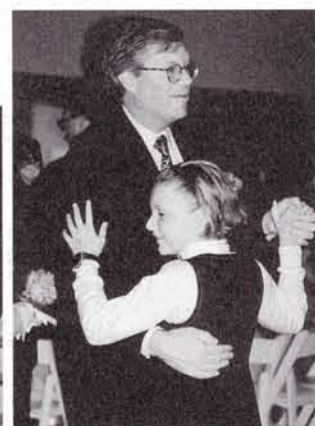
▲ Middle School dads took daughters in hand.