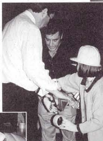
▲ Student construction workers plotted, measured, built, and decorated their cardboard dream homes with the help of moms, dads, and brothers and sisters who came along to enjoy the fun.