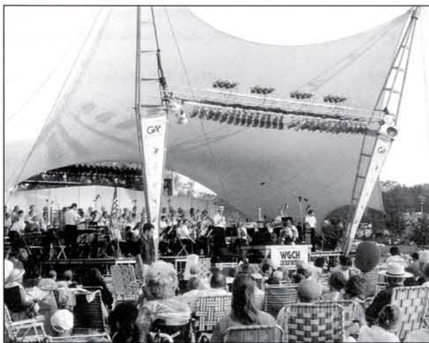
At last year's Pops Concert at Roger Sherman Baldwin Park, music lovers came to picnic and listen to the Greenwich Choral Society and the Greenwich Symphony Pops Orchestra.