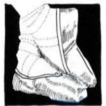
Illustrations by Gretchen Tatge